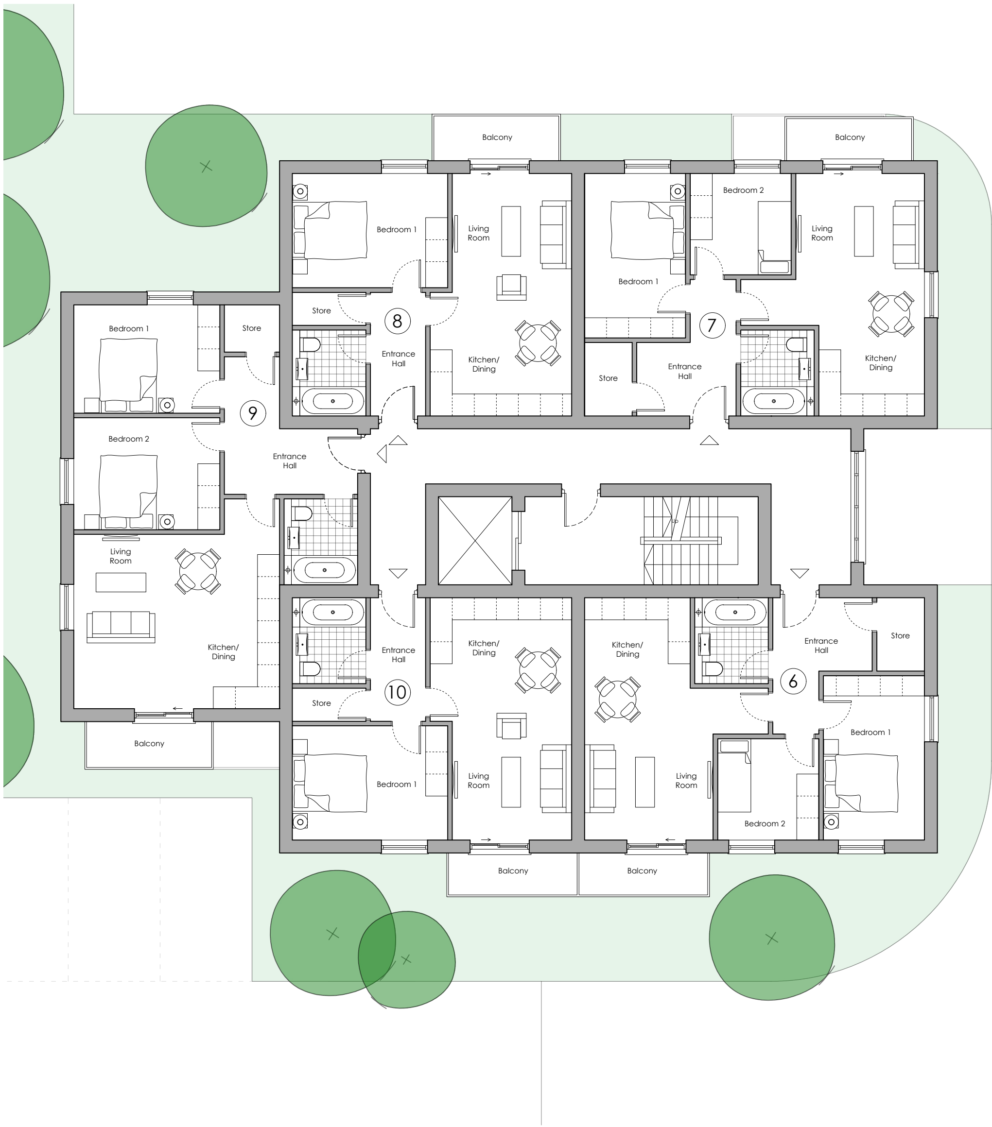
Proposed First Floor Plan 1:100 @ A2